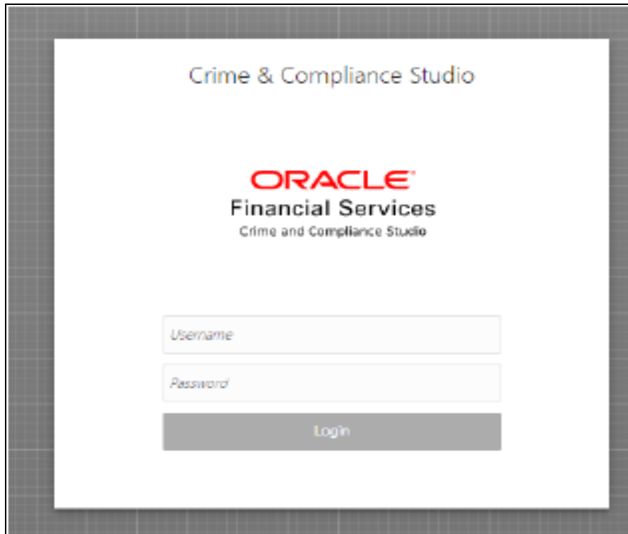
Figure 6: FCC Studio Application Login Page